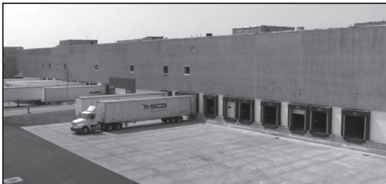
York Business Center EGL dock fit-out